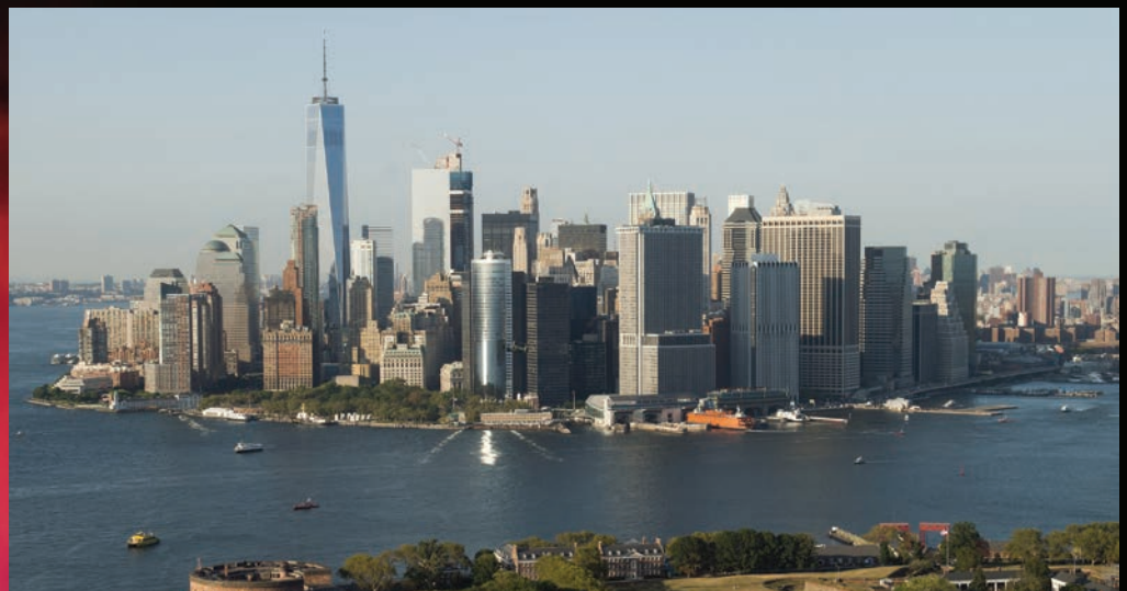
Top of the heap: New York attracted the most FDI projects between 2012 and 2016, and boasts the highest GDP in the rankings

T he bright lights of New York have again outshone every other city on either American continent. The metropolis attracted 819 FDI projects between 2012 and 2016 – the highest number of all locations in this study. Most investment in the city was derived from companies from western Europe (68.6%), followed by Asia-Pacific (14.8%) and North America (6.7%).